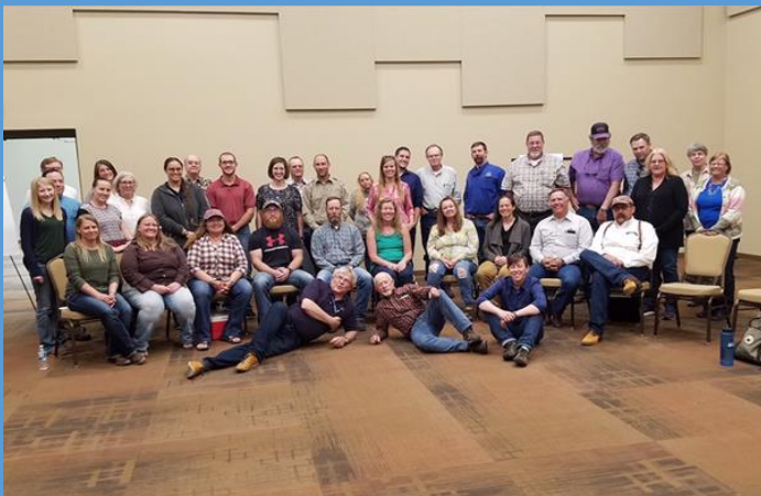
Photo 1 - Workshop Closing Circle